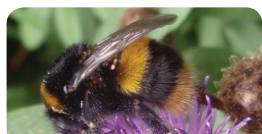
Common species: ( Bombus terrestris ) the buff tailed bee