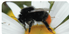
Common species: ( Bombus lapidarius ) the red tailed bee