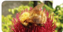
Common species: ( Bombus pascuorum ) the carder bee