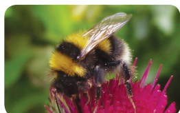
Common species: ( Bombus hortorum ) the garden bee