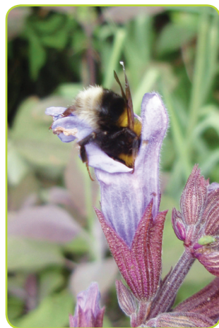
▲ Long tongued bee in tube flower, white tail so this has to be Bombus hortorum