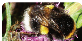
Common species: ( Bombus lucorum ) the white tailed bee