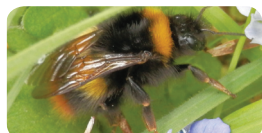
Common species: ( Bombus pratorum ) the early bee