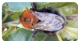
Common species: ( Bombus hypnorum ) the tree bee